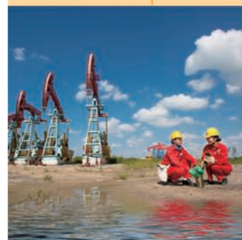
Exploration and Production