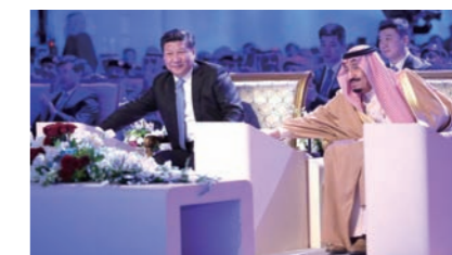
Leaders of China and Saudi Arabia attended the operation launch ceremony of YASREF

■ We provide aid to improve local infrastructure, actively carry out public welfare activities and support local social development.