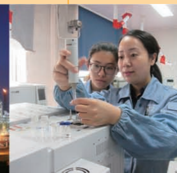
Technology Research and Development