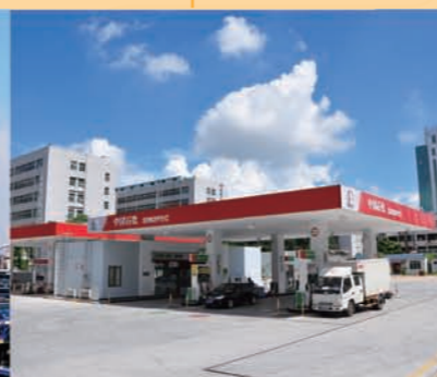
Marketing and Distribution