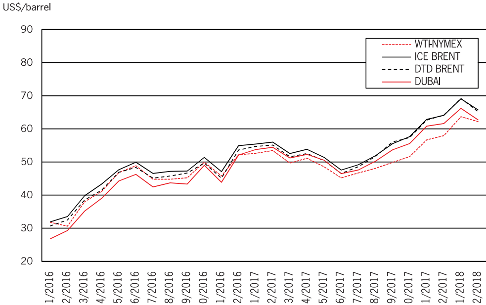
Trend of International Crude Oil Prices

In 2017, international crude oil prices fluctuated at low level among the first three quarters, and rapidly went up in the 4th quarter. The average spot price of Platt’s Brent for the year was USD 54.19 per barrel, up by 23.9% from the previous year. Along with the adjustments of China’s energy structure, domestic demand for natural gas became robust. Domestic apparent consumption of natural gas reached 237.3 billion cubic meters, up by 15.3% year on year.